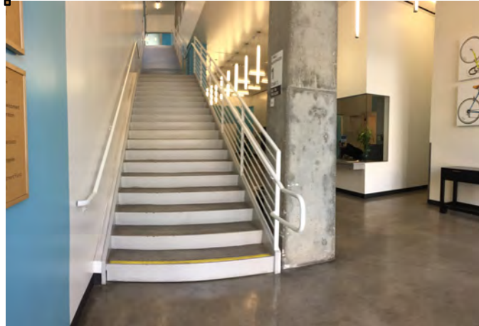
Figure 2: This photo shows the stairs that connect the offices of the professional support staff (1 st floor) to the residential floors (2 nd -6 th floors).

representatives of the agencies that serve them” (Holland 2014). A large sign behind the front desk reads: “this office is dedicated to ending homelessness in Los Angeles”, the collective goal of the health providers, Resident Services Coordinators (RSCs), psychiatrists and residents working and residing in the building.