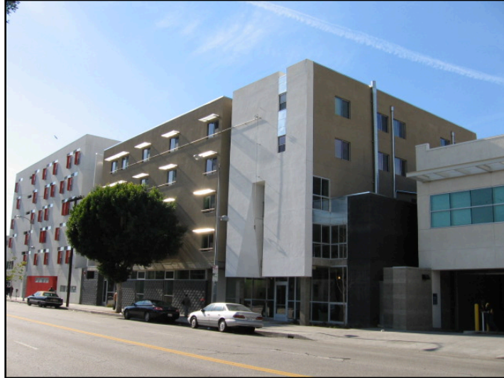
FIGURE 3: The door behind the silver car is Abbey's main entrance. The red and white building is Rainbow Apartments.