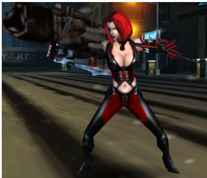
The female figure used in advertising for EverQuest :