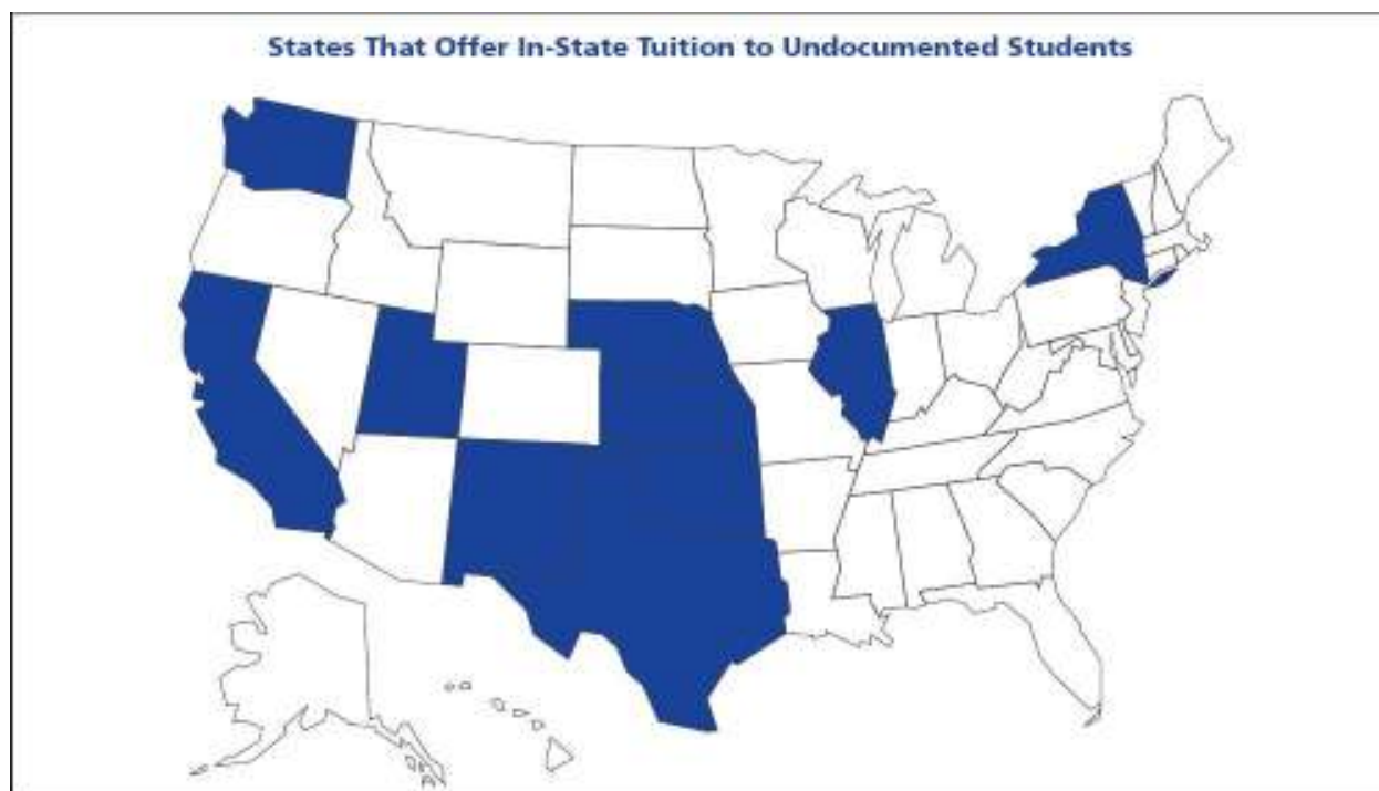
Image 1. Map depicting ten states that offer in-state tuition legislation: California, Washington, Utah, New Mexico, Nebraska, Kansas, Oklahoma, Texas, Illinois and New York.