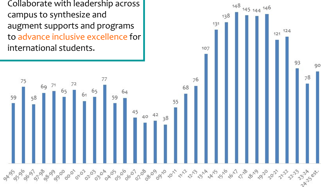
International Student Enrollments Matriculated and Exchange/Visiting