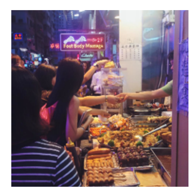
Pictured is a Tai Pai Dong style vender selling street food in Mong Kok.

recognized by the Hong Kong Food and Environmental hygiene Department).<sup>27</sup> Despite complaint of the dirty, crowded, and unhygienic qualities of Dai Pai Dongs, locals are optimistic that their historical connection to "old Hong Kong" will pressure the government to preserve the food stalls. Dai Pai Dongs serve as a representation of affordable and balanced meals.