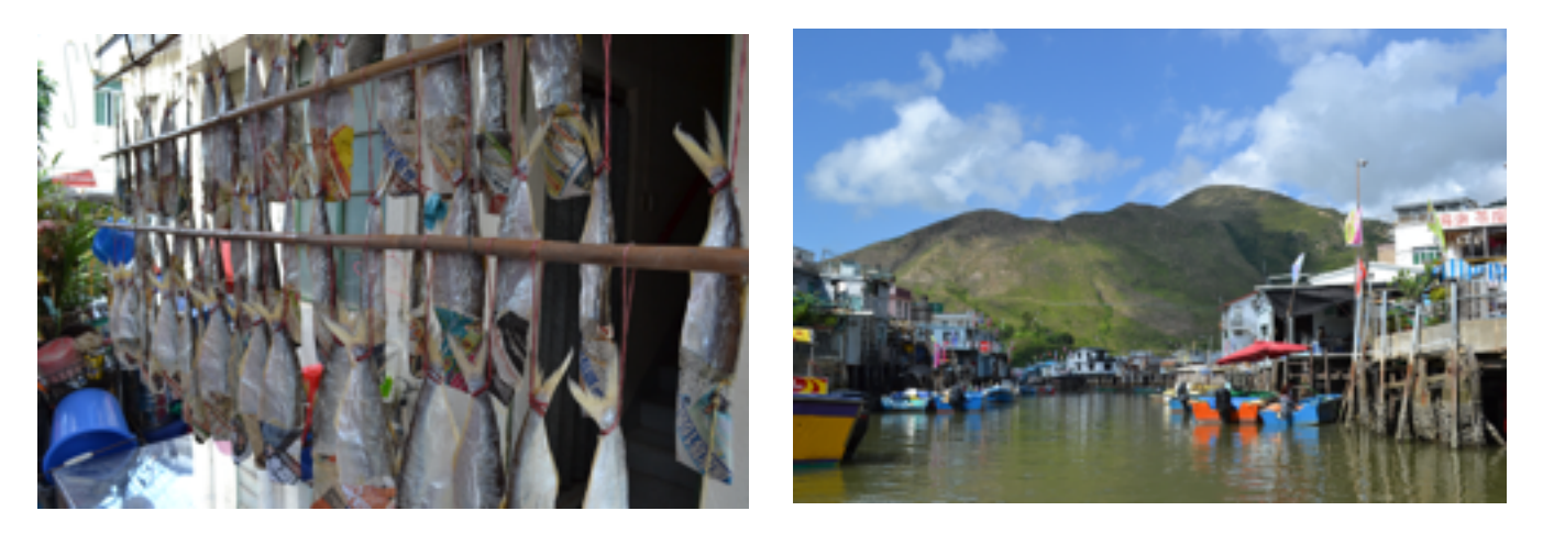
Pictured above is fish sold in one of the wet market stalls in Tai O. Tai O is one of the few remaining fishing villages in Hong Kong. Though it used to be one of the most important fishing ports of the city because of its shallow waters with high amounts salts for preservation, the decline of the fishing industry and rise in importing has drastically changed the village overtime.

produce, today, wet markets continue to suffer from a continued decline. Concerns about hygiene and comfort and the convenience of "one-stop-shopping" markets have contributed to their decline. As well, most food in wet markets is purchased from street hawkers or the wholesale market rather than brought in by the farmers themselves.