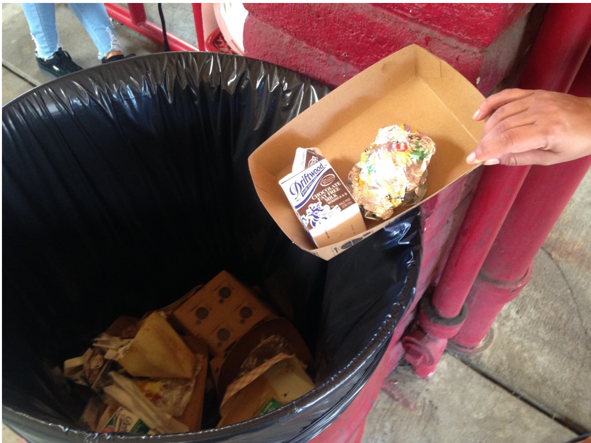
Students throw away lunch trash at Roosevelt High School.

In the eyes of the district and cafeteria managers, providing vegan meals offers an additional option that has the potential to offset the extreme amount of food waste. While only one or two vegan lunches may be sold in a day, these could potentially be two meals eaten and thus unwasted by students. Additionally, additional meals increase the district's sale numbers, ultimately increasing their bottom line, providing a practical remedy to the food waste problem.