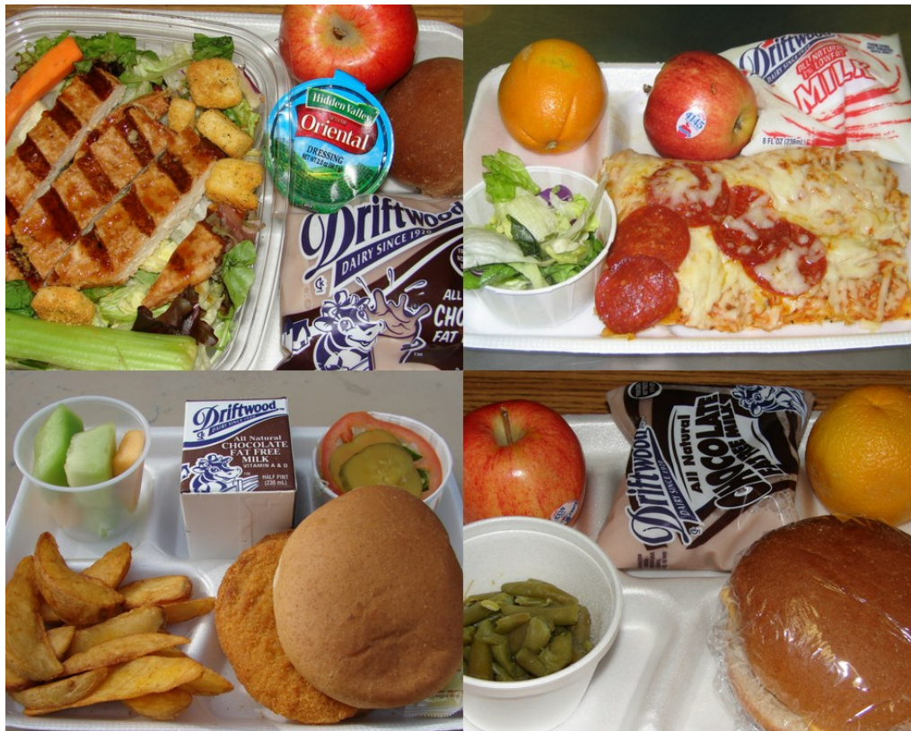
LAUSD lunches through the years.

LAUSD had committed to offering a vegetarian option at each meal since 2003, and had recently featured "Meatless Mondays" menus as well, and now with the vegan pilot is offering more school fully plant-based foods for students. The vegan pilot program is the one of the first among its kind to be implemented in a public school district in the United States.