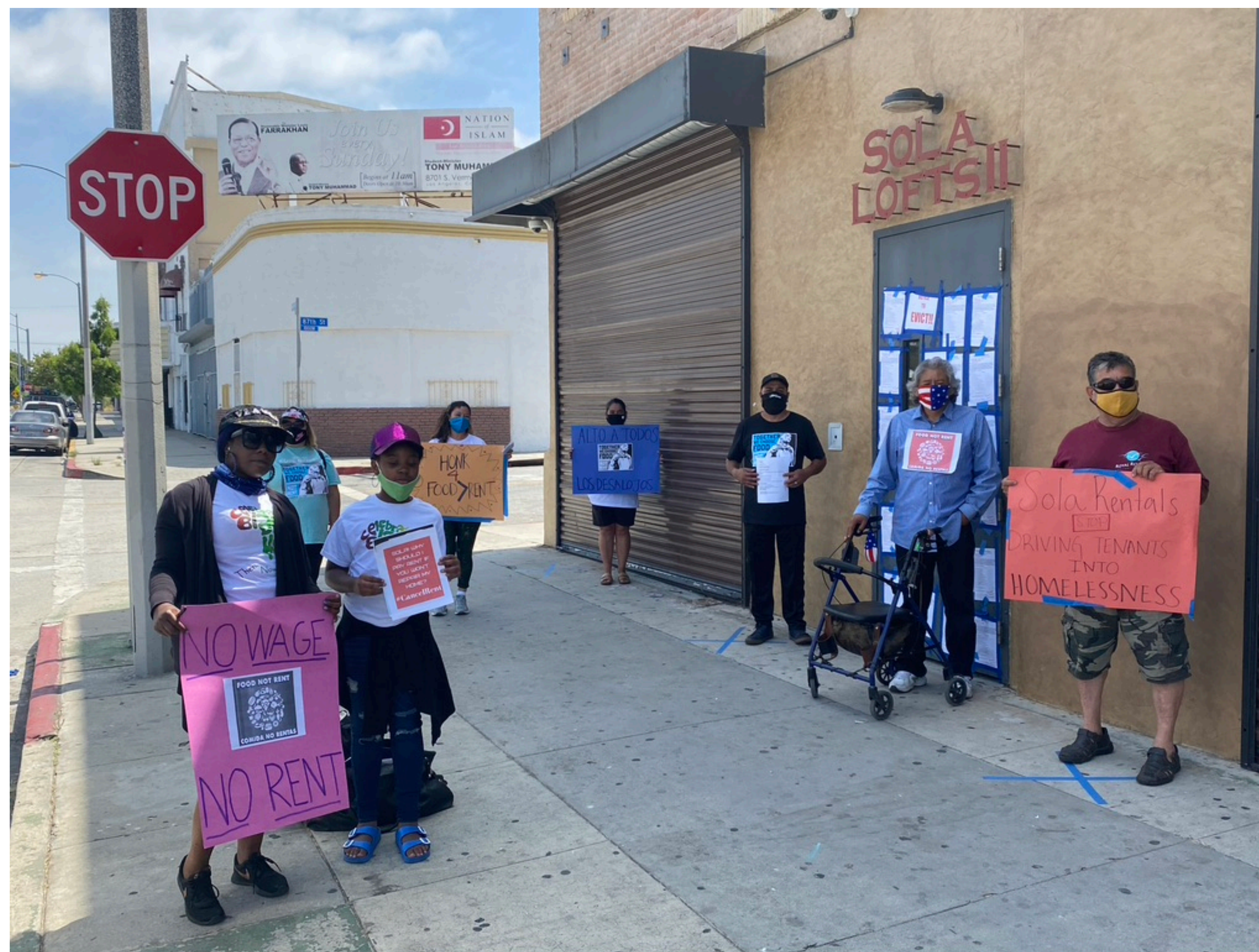
One of the challenges we faced as organizers was keeping everyone safe while continuing to keep our members involved.